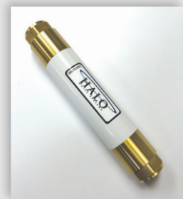
STAGE 3 ION Scale Inhibitor

IMPORTANT NOTICE: all filtration systems contain other parts that have a limited service life. To prevent costly repairs or possible water damage we strongly recommended that the bowl or sump of all plastic housings be replaced periodically: every 5 years for clear sumps and every 4 years for opaque sumps. If your sump has been in use for more than the recommended period, it should be replaced immediately. Be sure to date any new replacement sump for future reference and indicate the next recommended replacement date.