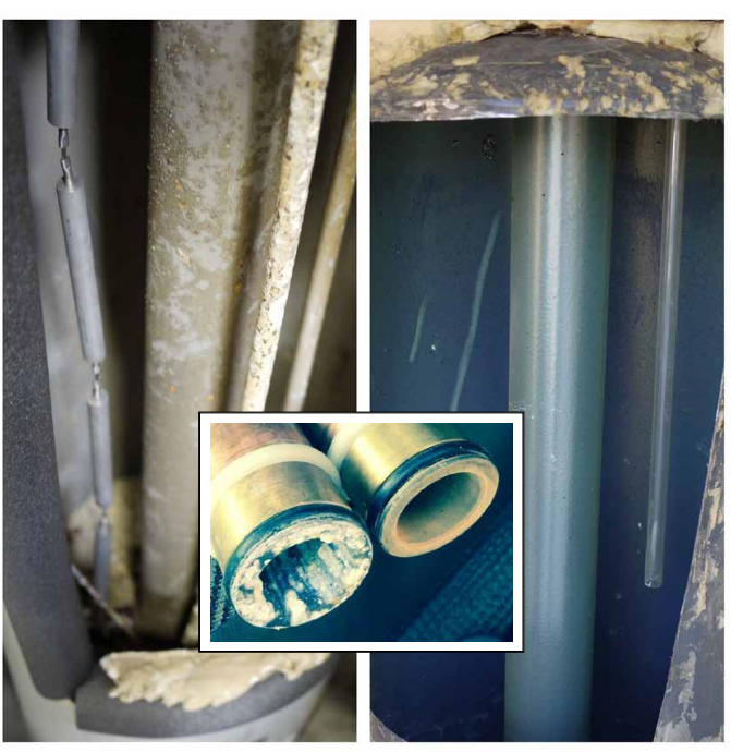
WITHOUT TREATMENT with no water treatment installed. Accumulation of Scale & Corrosion

What difference does the proprietary ION 2.0 Plus Scale Inhibitor make?