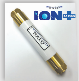
STAGE 3 ION Scale Inhibitor Permanent Do Not Remove

IMPORTANT NOTICE: all filtration systems contain other parts that have a limited service life. To prevent costly repairs or possible water damage we strongly recommended that the bowl or sump of all plastic housings be replace periodically: every 5 years for clear sumps and every 4 years for opaque sumps. If your sump has been in use for more than the recommended period, it should be replaced immediately. Be sure to date any new replacement sump for future