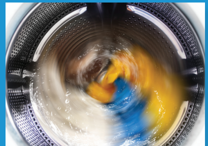
HALO TO KEEP FABRICS FRESH.