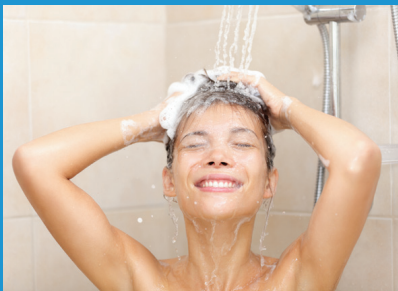
HALO TO FEEL HEAVENLY.