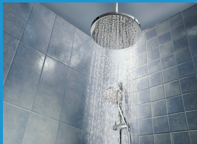
HALO TO KEEP YOUR FIXTURES LOOKING FABULOUS.