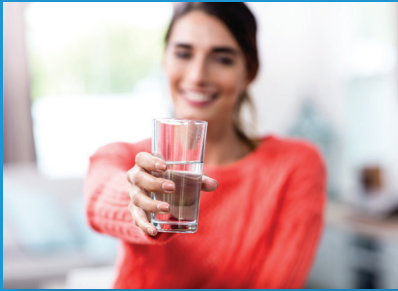
HALO FOR YOUR HAPPINESS.