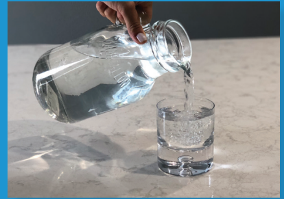
HALO FOR YOUR HEALTH.