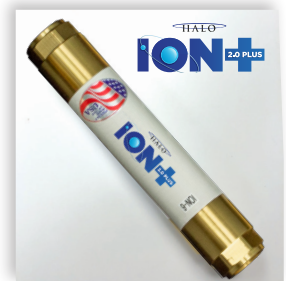
STAGE 3 ION Scale Inhibitor Permanent Do Not Remove

IMPORTANT NOTICE: all filtration systems contain other parts that have a limited service life. To prevent costly repairs or possible water damage we strongly recommended that the bowl or sump of all plastic housings be replace periodically: every 5 years for clear sumps and every 4 years for opaque sumps. If your sump has been in use for more than the recommended period, it should be replaced immediately. Be sure to date any new replacement sump for future