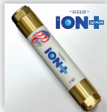
STAGE 3 ION Scale Inhibitor Permanent Do Not Remove