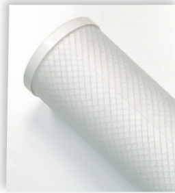
STAGE 2 HAC CARBON