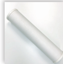
STAGE 2 HAC CARBON