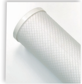
STAGE 2 HAC CARBON