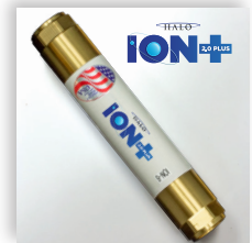
STAGE 3 ION Scale Inhibitor Permanent Do Not Remove