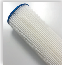
STAGE 1 5 MIC. SEDIMENT